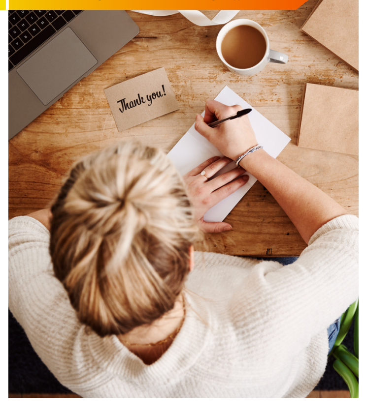
NO BUDGET? NO PROBLEM! These small gestures make a big difference.